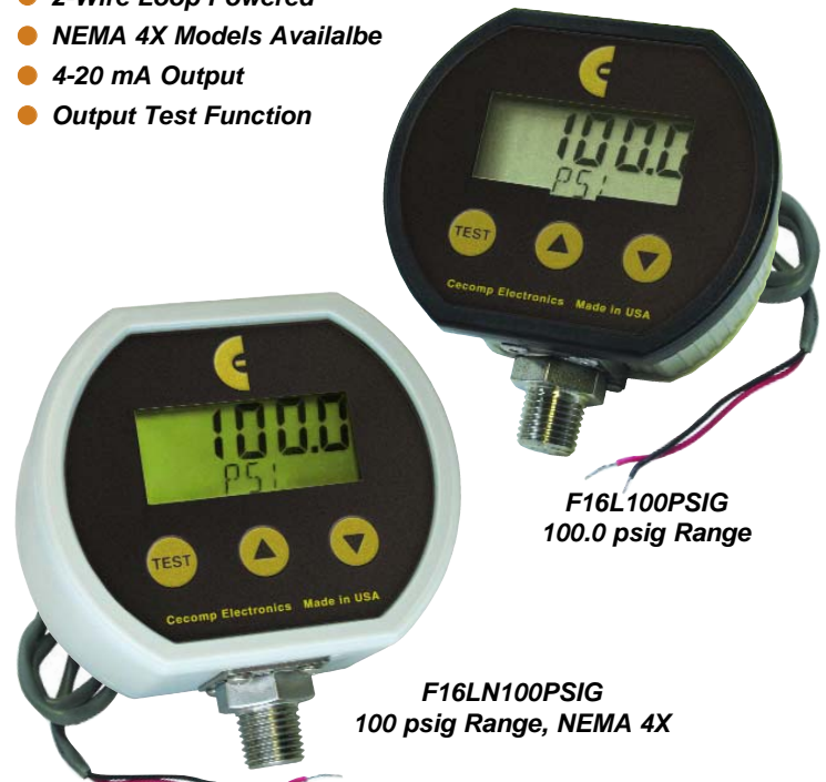
F16L100PSIG 100.0 psig Range