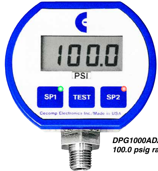
DPG1000ADA 100.0 psig range