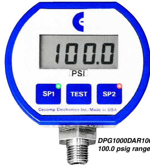
DPG100DAR100PSIG-1N-I 100.0 psig range