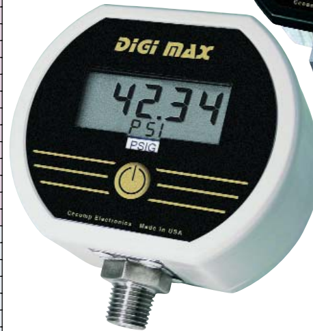
F16B60PSIG-5 0 to 60.00 psig range