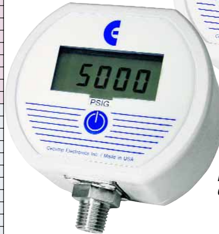
F4B100PSIG-5 0 to 100.0 psig range