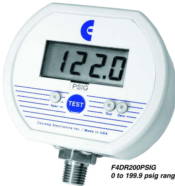
F4DR200PSIG 0 to 199.9 psig range