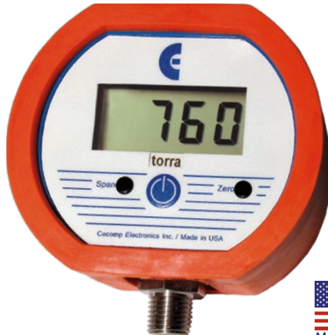
ARM760B with RB Rubber Boot