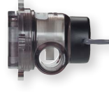
SFI with A-711 Option